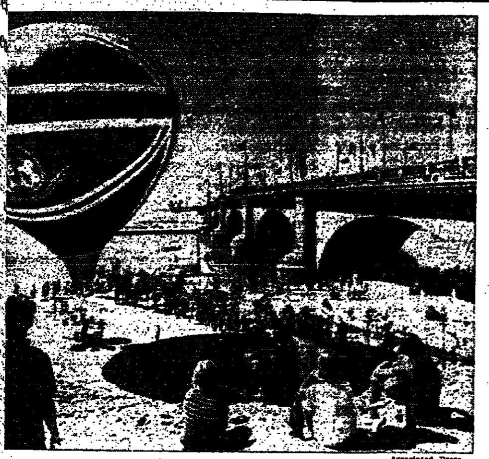
CROSSING—With a dedication by the Lord Mayor of London, and with some fanfare, London Bridge was officially opened Sunday, for the second in 140 years. A long way from home at Lake Havasu City in the Arizona desert.

However, they said thousands would attend the rally whether or not permits were obtained.